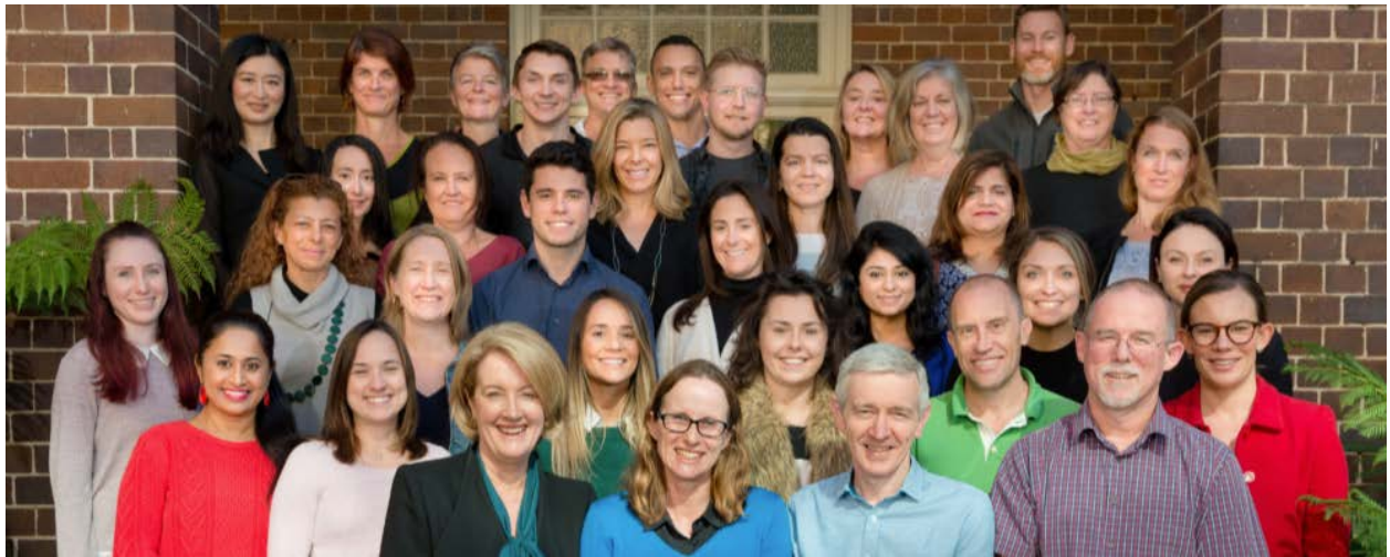
The IMH Team